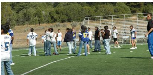
Sophomores Get Set for the Bat Spin