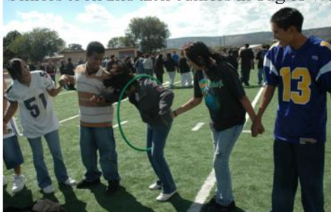
Juniors Pass the Hula Hoop